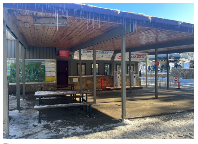
Figure 5 Note the general deterioration of the timber ceiling lining to the awning.