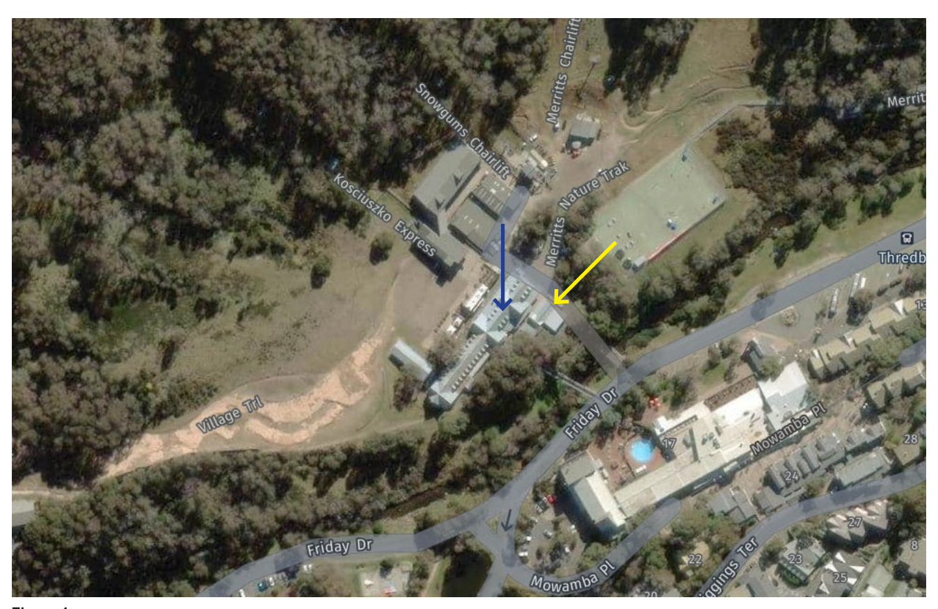
Overview of the area of the subject site. The yellow arrow indicates the awning of the Guest Services Building, where the additional scope is located. The Guest Services building is considered to form a part of the Heritage listing of the Valley Terminal site. The Valley terminal building to which the Statement of Heritage Impact addressed is indicated with a blue arrow.

GBA Heritage acknowledges the traditional custodians of the subject site, and pay our respects to Elders past, and present.