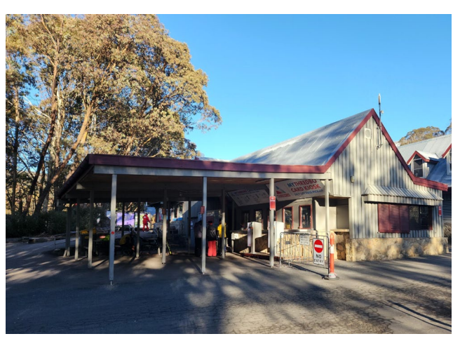
Figure 3 View from the northeast of the Guest Services building.