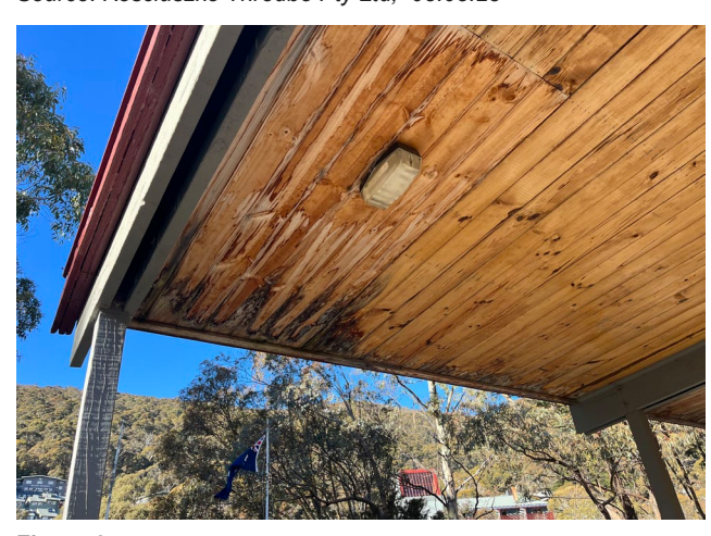
Figure 6 Northeast corner of the awning, note the deterioration of the timber ceiling lining. Also note the previous area of the lining that has been patched.

Source: Kosciuszko Thredbo Pty Ltd, 08.08.23