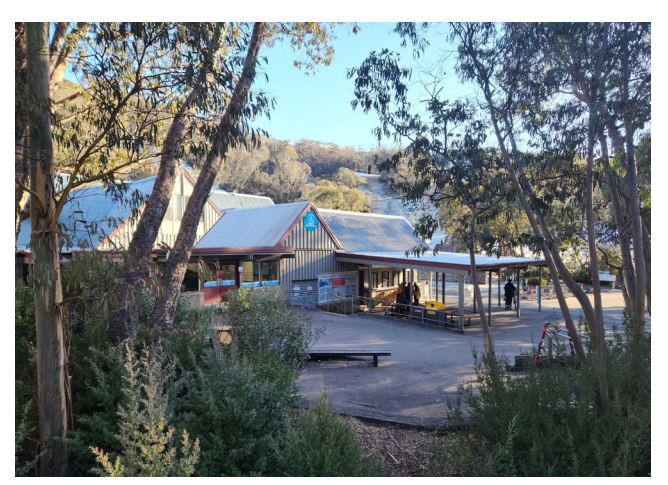
Figure 2 Guest Services building, note the close proximity of the Valley Terminal building behind. Source: Kosciuszko Thredbo Pty Ltd, 08.08.23