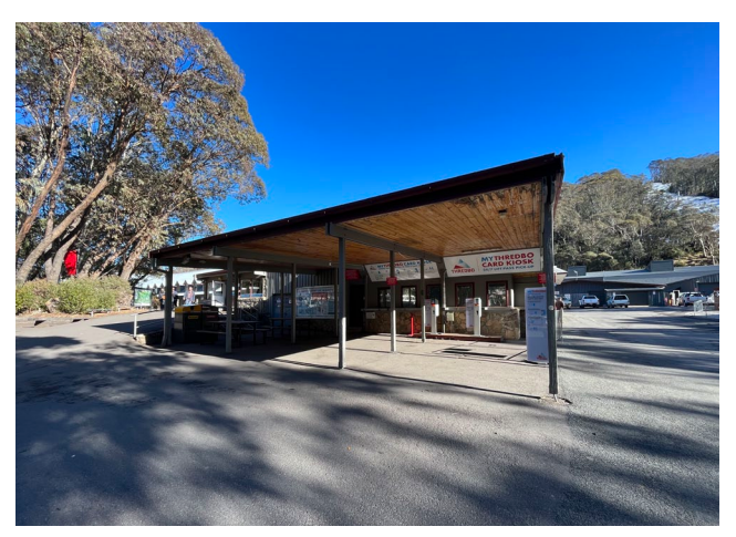
Figure 1 Guest Services building with the awning.