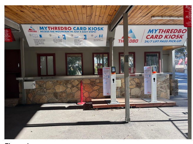
Figure 4 The 5 ticket booth windows to be reinstated, with existing signs Source: Kosciuszko Thredbo Pty Ltd, 08.08.23